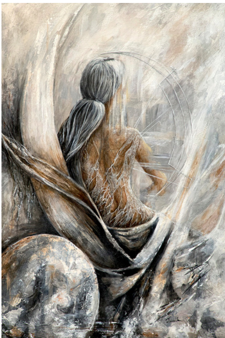
MOON GIRL 28” x 40”