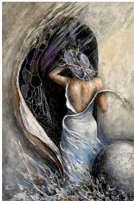
LADY IN THE HAT 28”x 40”