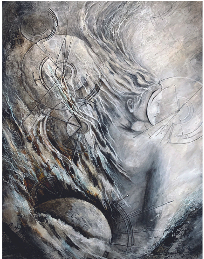
CIRCULAR VIBRATIONS ACRYLIC ON PAPER (FRAMED 21"X25")